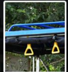
LUGGAGE CARRIER & IRON ROOF