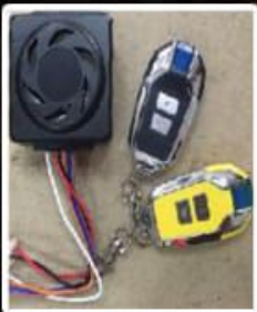
CENTRE LOCKING WITH WHEEL SEIZE FEATURE