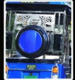
STAINLESS STEEL ARMREST & BUMPER