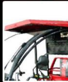
MUSIC SYSTEM WITH PANEL