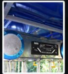
MUSIC SYSTEM WITH PANEL