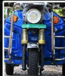
43MM HYDRAULIC SHOCKER WITH BUTTERFLY DESIGN & STEEL LEG GUARD