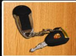
CENTRE LOCKING FEATURE