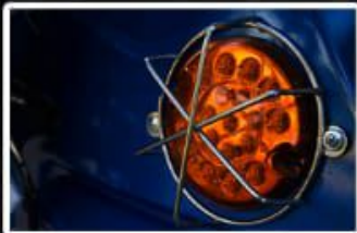
WITH LED LIGHTS