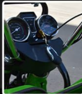
SPEED & CHARGE INDICATING METER