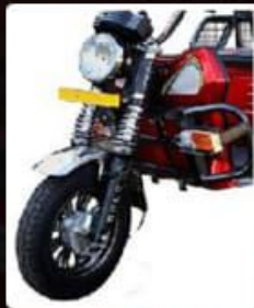
FRONT HYDRAULIC FORK STRONG 43MM CHASSI WITH BUTTERFLY & LEGGUARD